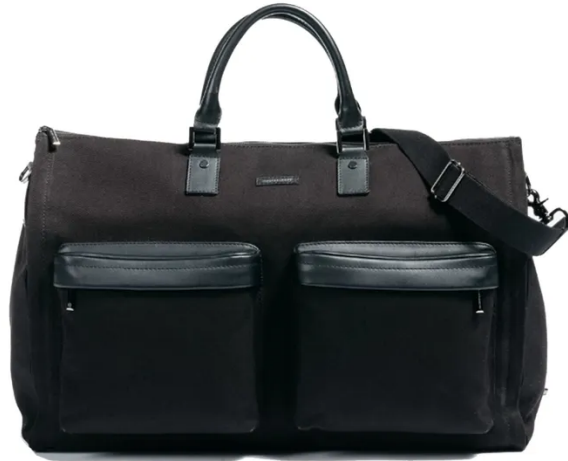
Hook & Albert nylon twill garment weekender bag